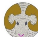
ISAAC & REBECCA Genesis 22:1-8