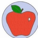
ADAM & EVE Genesis 3:1-7