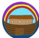
NOAH Genesis 9:8-17